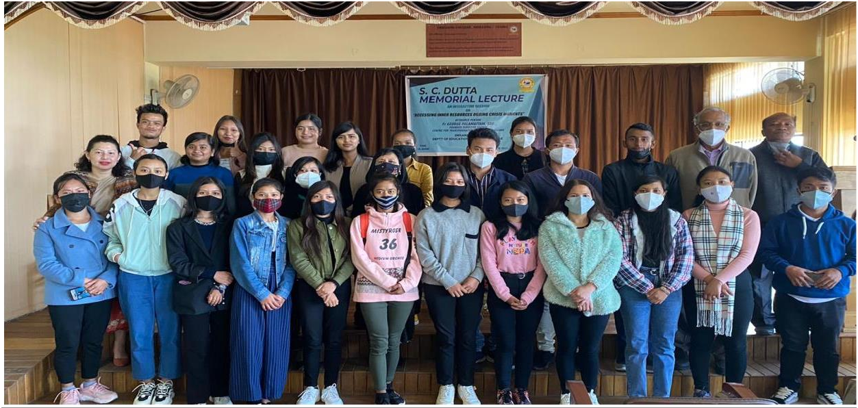
Students with teachers and Resource Person