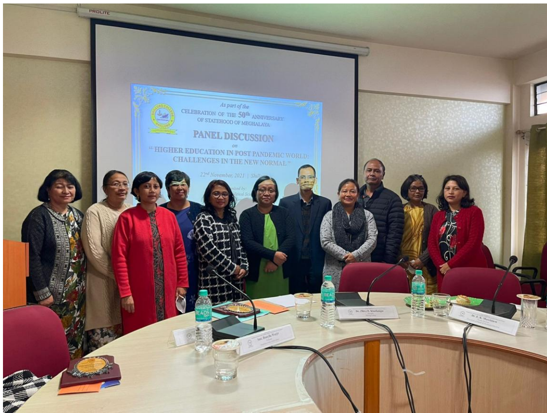
The Department of Political Science and Department of Sociology, Shillong College Organise a Panel Discussion on the theme “Higher Education in Post Pandemic World: Challenges in the New Normal’ on 22 nd of November, 2021